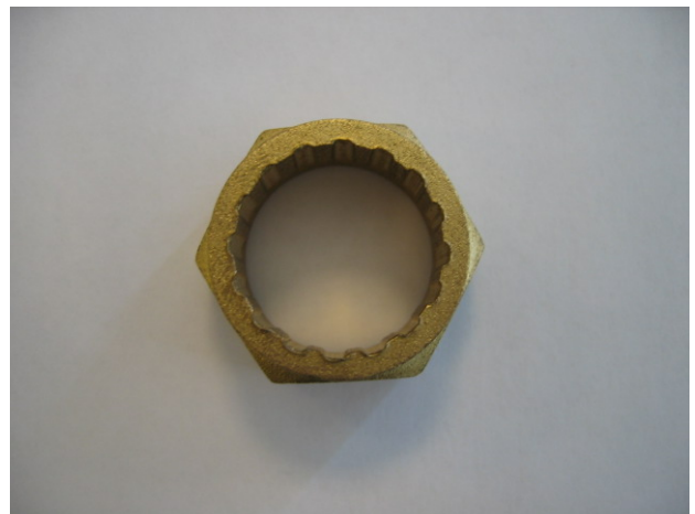
New dismantling union nut.